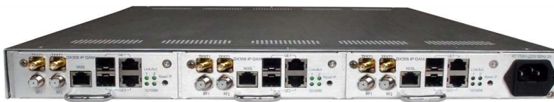
Three OX308 8 in1 IP Mux-QAM Modules (24 QAM Carrier in all)