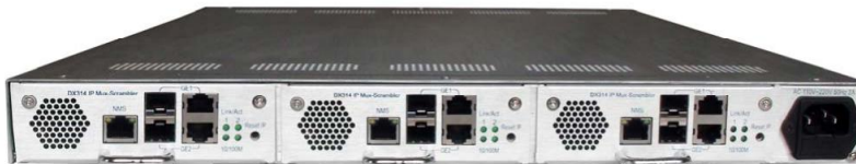
Three OX314 12 IP input and 4 TS output IP-Mux Scrambler Module (12 Mux-Scrambling IP output in all)