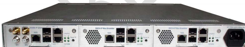
One OX308 8 in 1 IP-Mux QAM module and two OX314 12 channel IP input and 4 TS output IP-Mux Scrambler Modules. (8 channel QAM carrier and 8 Mux-scrambling IP output in all)